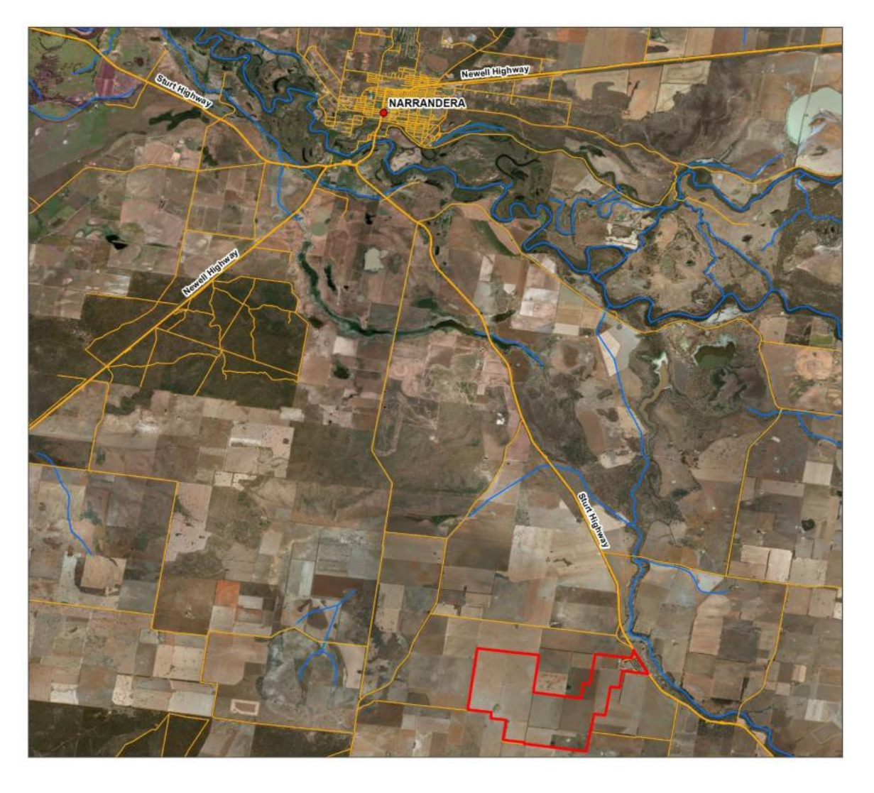
Figure 1-1: Avonlie Solar Farm site location (depicted in red)<sup>1</sup>

Construction of the Project will take an estimated 15 months to complete. The ASF is expected to operate for about 30 years, after which the ASF would be reconditioned or decommissioned. The Project is currently undergoing a detailed engineering design process to enable commencement of construction in mid 2021. The location of the site is shown in Figure 1-1 below.