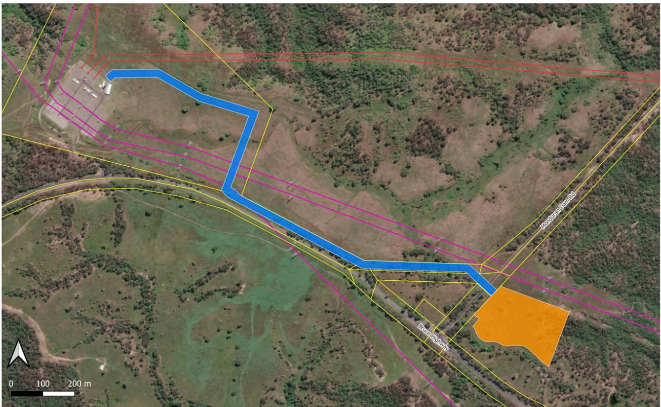
Gin Gin Battery Facility - Project Site

The proposed Gin Gin Battery project is located on privately owned land on Bailai, Gurang, Gooreng Gooreng, Taribelang Bunda Country. Located approximately 20 km west of the Gin Gin township, on the Bruce Highway, Bundaberg Regional Council is the local government authority.