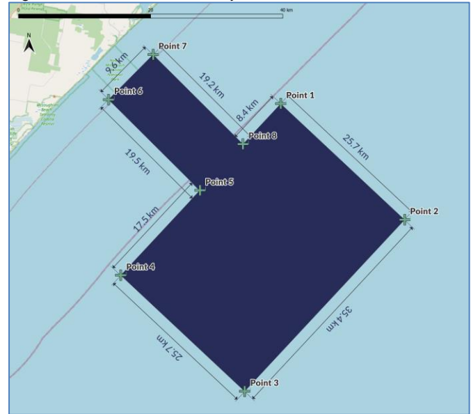
Figure 1: Points 6 and 7 survey area within 3NM